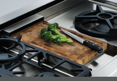
Chopping block accessory