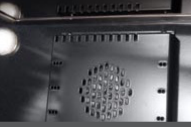
Infrared gas broiler