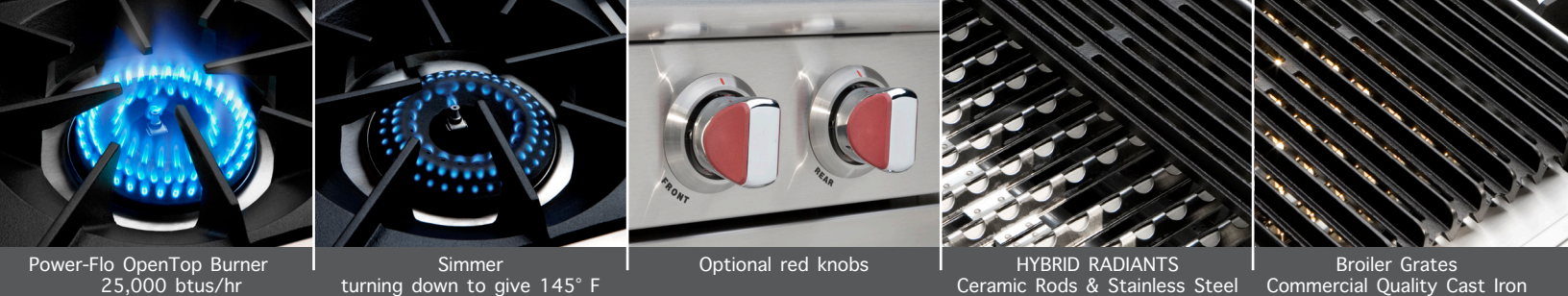
Power-Flo OpenTop Burner 25,000 btus/hr