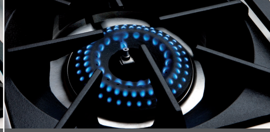
Simmer turning down to give 145° F