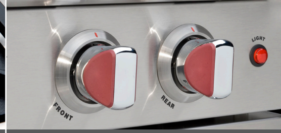
Optional red knobs