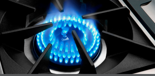
Power-Flo OpenTop Burner 25,000 btus/hr