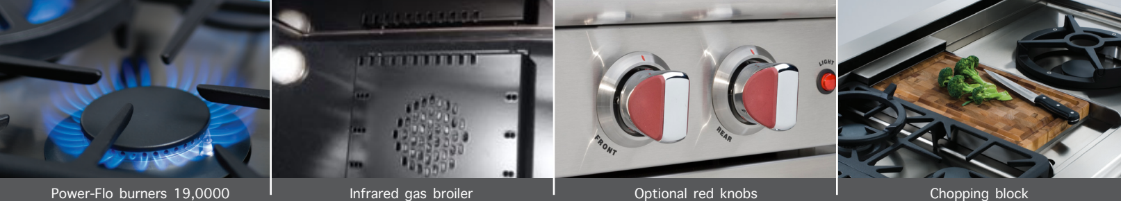
Power-Flo burners 19,0000 BTU-140 deg. simmer.